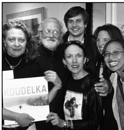
Launching of Koudelka book at Aperture.