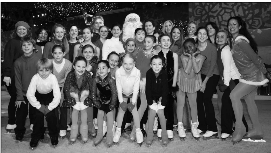
Tree Lighting at Rockefeller Center.

For the 10th-time Ice Theatre provided skating clinics for NYC school children as part of the annual Sports and Arts in Schools Festival in February at Riverbank State Park.